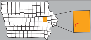
Photo - March, 2011

Iowa Department of Transportation PUBLIC INFORMATION MEETING November 13, 2013 LINN COUNTY IOWA 100 EXTENSION PROJECT Project Number: NHS-100-1(36)-19-57