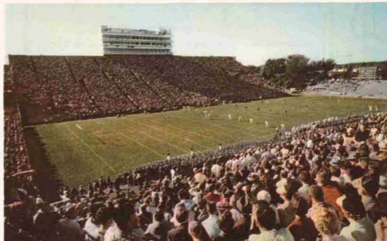
University of Iowa Hawkeyes—1958 Big 10 champs and winners of the 1959 and 1957 Rose Bowl Classic.