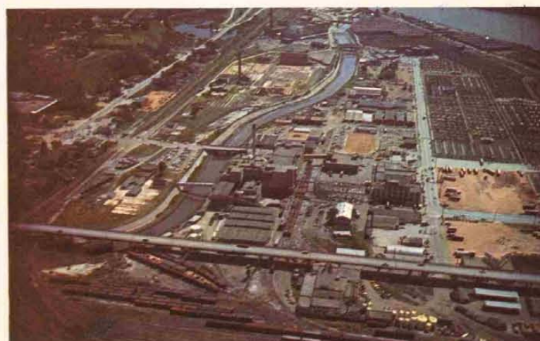
General farming and livestock raising excepted, the processing and packing of meat is Iowa's largest industry.