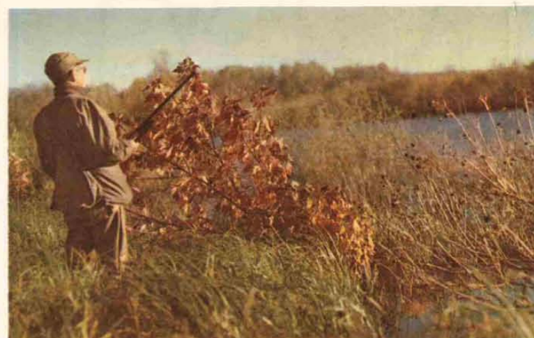
Iowa's waterfowl and upland game hunting provide many hours of healthful outdoor recreation.