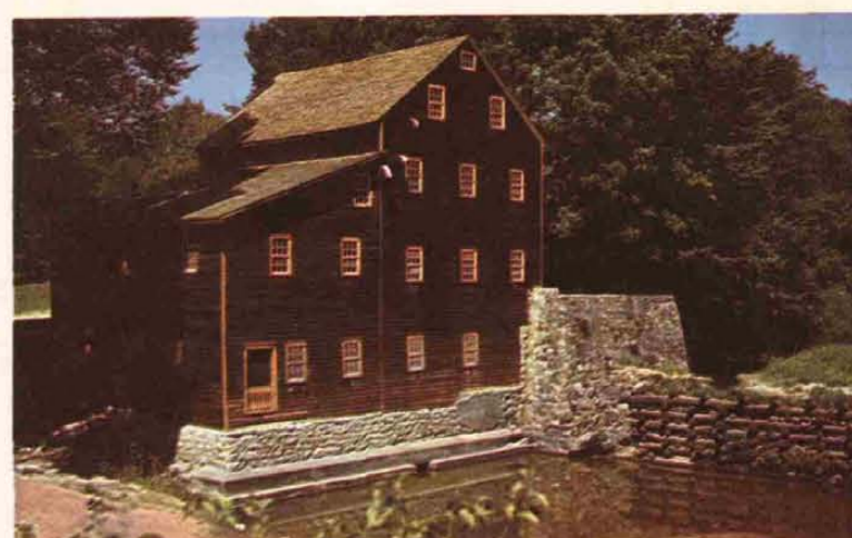
Old Grist mills in some state parks have been preserved to remind visitors of an earlier era in Iowa history.