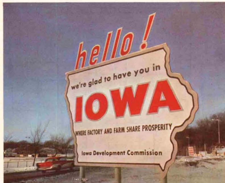
Iowa's 2,700,000 friendly people extend a warm welcome to all visitors. Thanks for being with us!

CIVIL RIGHTS IN IOWA All persons within this state shall be entitled to the full and equal enjoyment of the accommodations, advantages, facilities and privileges of inns, restaurants, chop-houses, eating houses, lunch counters, and all other places where refreshments are served, public conveyances, barber shops, bathhouses, theaters, and all other places of amusement. (735.1 Code of Iowa)