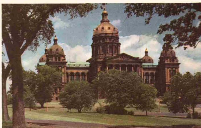
State Capitol Building in Des Moines was built in 1873. Center Dome is covered with 22 carat gold leaf.