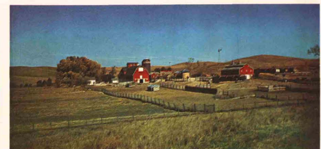
Rich soil and ideal climate combine to rank Iowa farms among the best in the world.