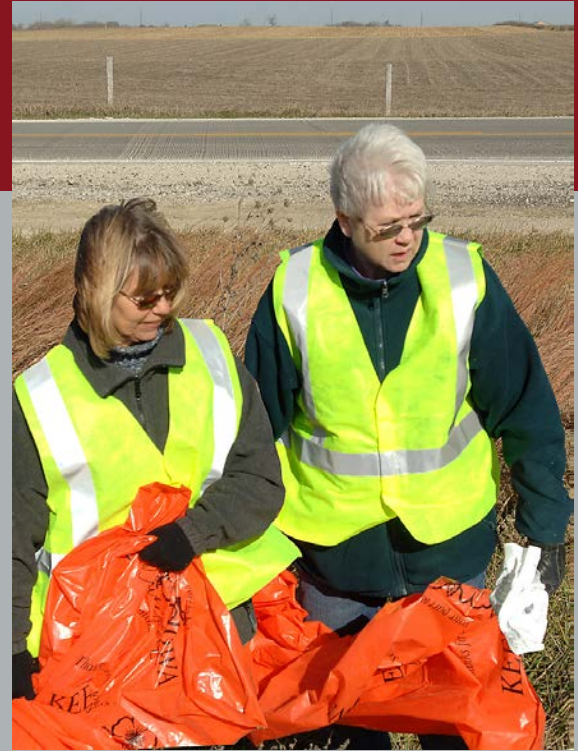
Wearing the required high-visibility vests enhances safety of AAH participants. The vests are available at your local Iowa DOT maintenance facility.

Federal and state laws prohibit employment and/or public accommodation discrimination on the basis of age, color, creed, disability, gender identity, national origin, pregnancy, race, religion, sex, sexual orientation, or veteran's status. If you believe you have been discriminated against, please contact the Iowa Civil Rights Commission at 800-457-4416 or Iowa Department of Transportation's affirmative action officer. If you need accommodations because of a disability to access the Iowa Department of Transportation's services, contact the agency's affirmative action officer at 800-262-0003.