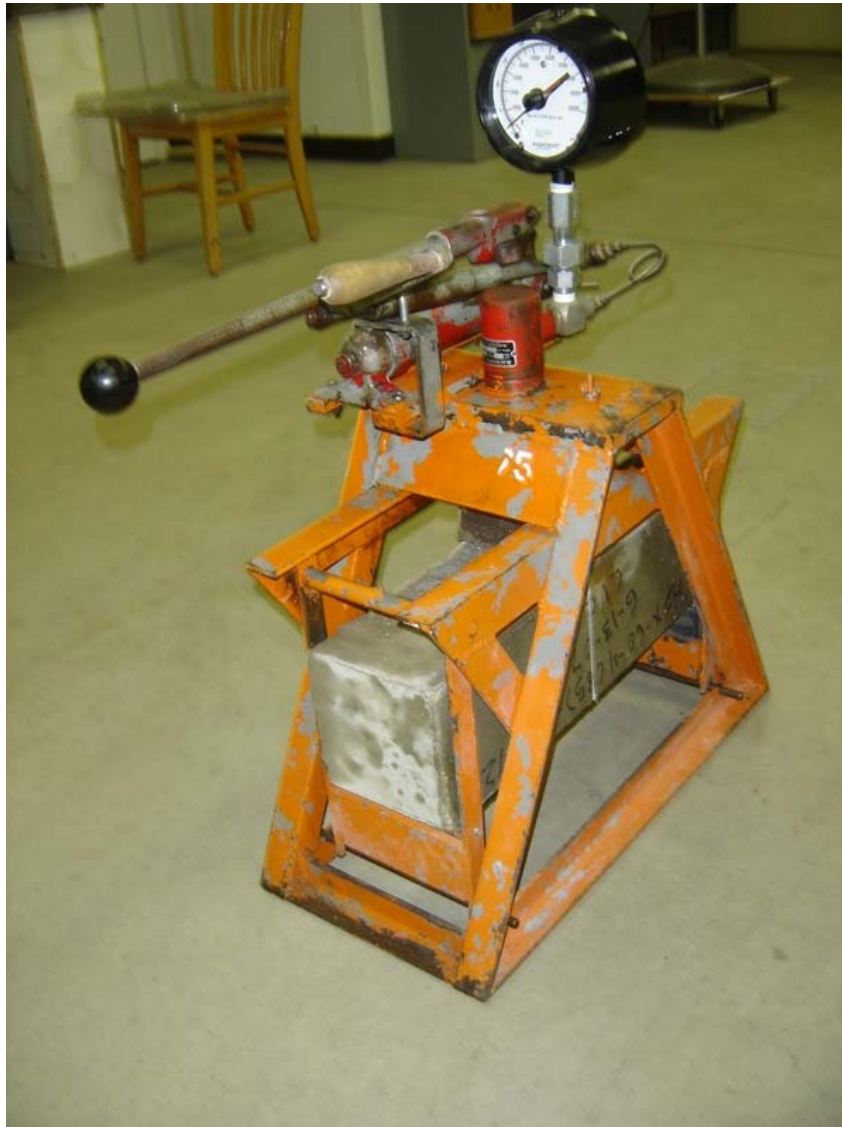
Figure 2. Concrete Specimen in Hydraulic Testing Machine