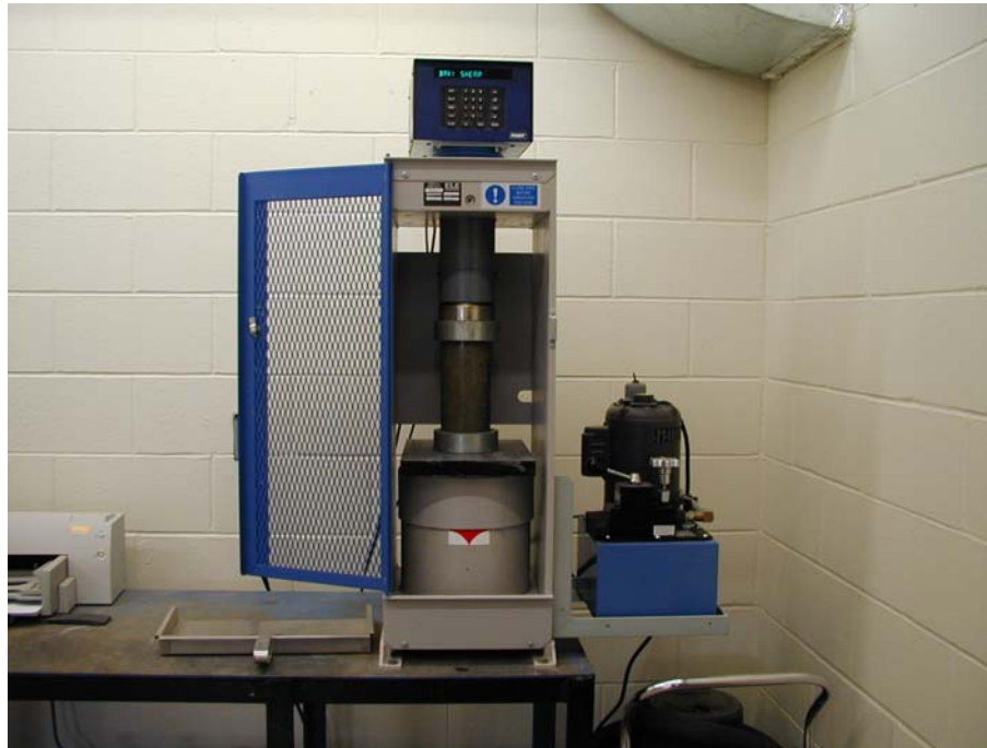
Figure 2. Compression Testing Machine