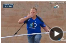
Nik Wallenda prays, kisses ground after can... Jun 24, 2013