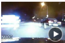
13-year-old charged with OWI after police chase Jun 17, 2013