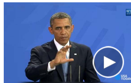
Obama details how controversial