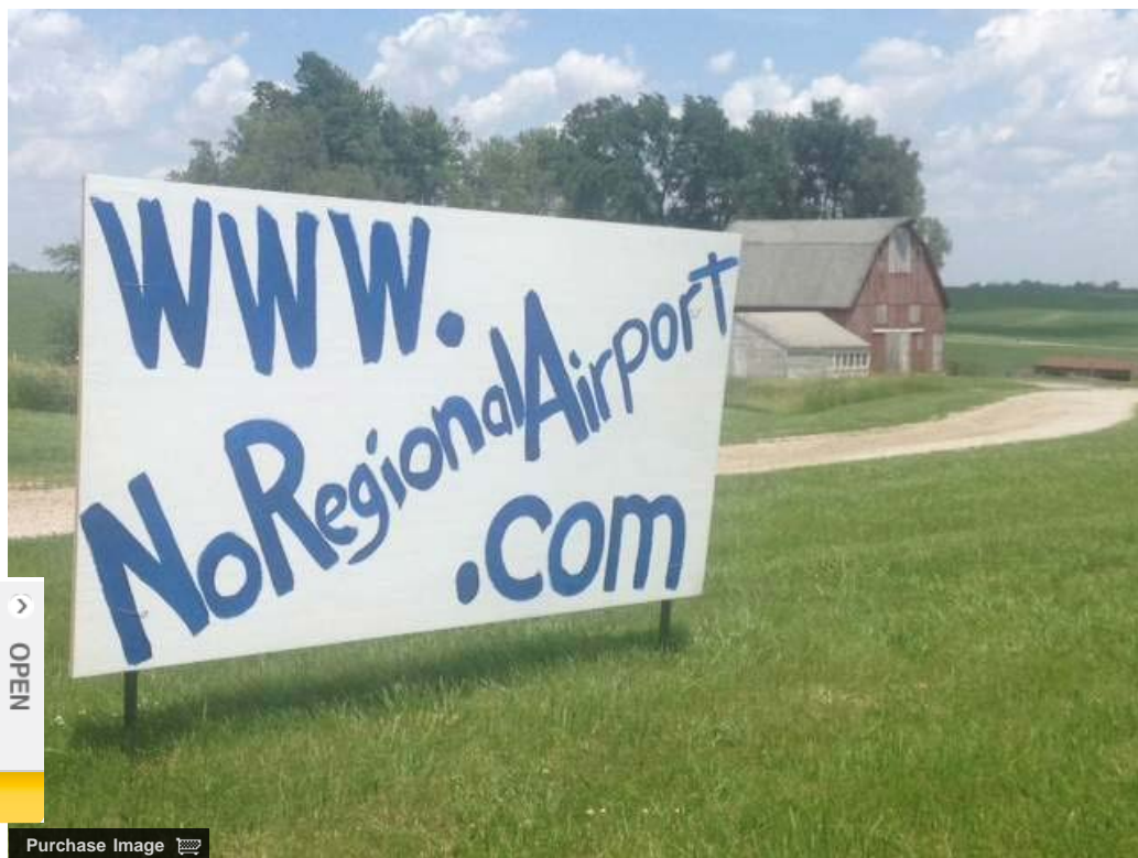
A sign near Pella protests a proposed regional airport.