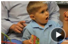
3-year-old boy hears for first time Jun 20, 2013