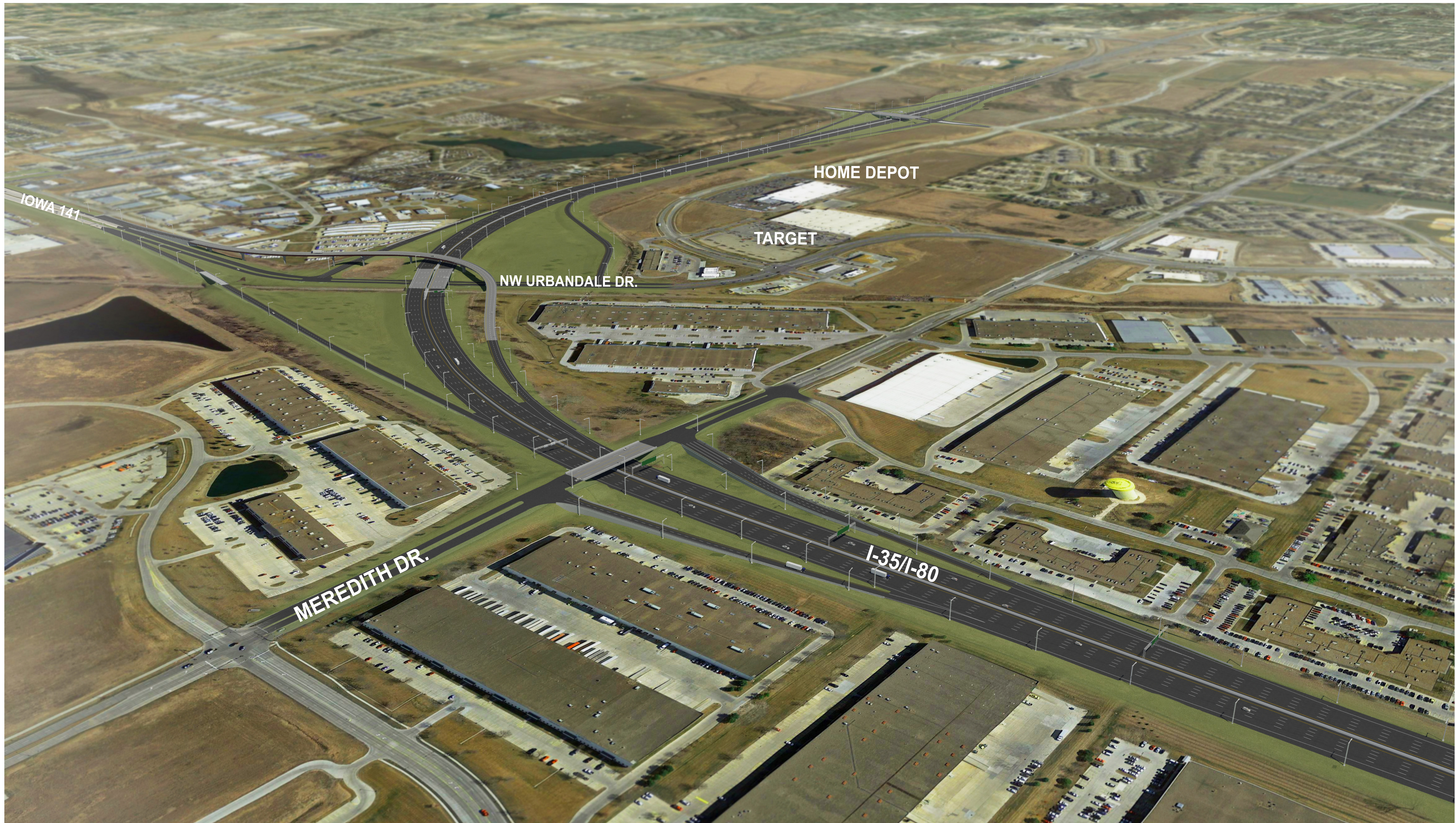
ILLUSTRATIVE RENDERING INITIAL BUILD-1