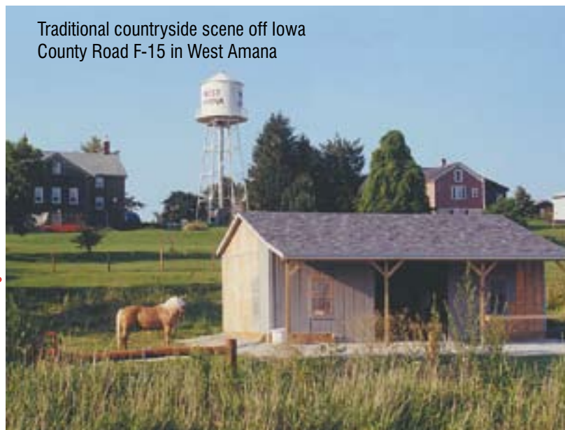
Traditional countryside scene off Iowa County Road F-15 in West Amana

For more information about attractions along the Iowa Valley Scenic Byway, contact the Amana Colonies Convention and Visitors Bureau and Welcome Center, 39 38th Ave., Suite 100, Amana, IA 52203, 800-579-2294; or visit the Amana I-80 Welcome Center, I-80, Exit 225, Amana, IA, 52203, 319-668-9545.