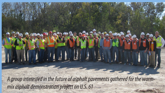
A group interested in the future of asphalt pavements gathered for the warm-mix asphalt demonstration project on U.S. 61

Following an overview of the technologies, the group toured the Manatt's plant site and were able to see and touch the recycled-shingle product, ground to the consistency of black sand. The tour continued to Wendling's quality control lab and finally to the project itself. Manatt's was placing new asphalt shoulders along existing U.S. 61. The construction train included a milling operation removing the existing rock shoulders, placement of a 4-inch asphalt base course and a final 2-inch surface course, with production averaging three miles per day.