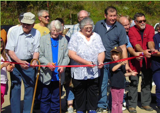
Local volunteers cut the ribbon on the improvements in August

Bowman said, "There were challenges with making sustainable improvements to accommodate large volumes of users in such a small area; and, because the type of improvements involved in developing water trails is still relatively new, there were new challenges for all of the parties involved. Everyone did a great job."