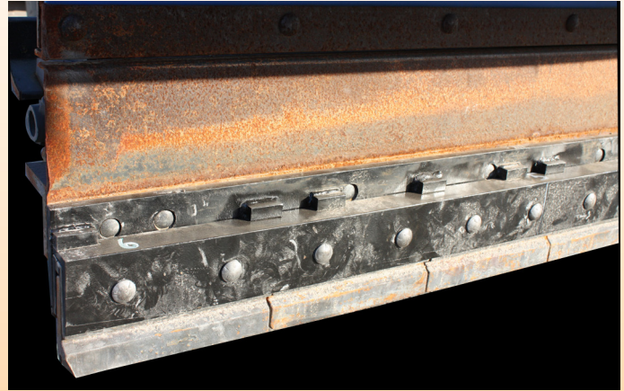
Commercially produced flexible snowplow blade

While last year's testing data showed the JOMA blade to be the most cost-effective, both the DOT-built prototype and another commercial blade showed promise as an alternative to the regular carbide. Dowd said, "The cost of the other commercial product was prohibitive and the DOT-built flexible edge blade needed further development to become a viable option. When we discussed the cost of the other commercial blades with the manufacturer, they were willing to take our suggestions and redesign the mounting system they were using," said Dowd. "We discussed a similar mounting system we used to mount the prototype blades the Iowa DOT's repair shop had built last year that could possibly reduce the cost. In essence, the manufacturer merged the features from the more expensive commercial blade with the DOT prototype's mounting system. We know from the testing last year that these blades are effective, so this year the emphasis of data collections in each district will determine the cost-to-benefit ratio."