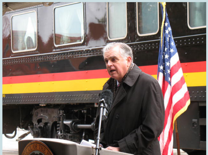
U.S. Secretary of Transportation Ray LaHood came to Iowa to present grant award