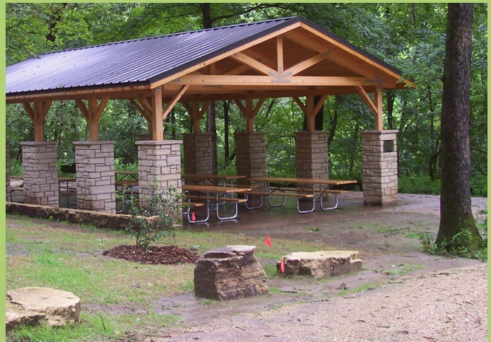
Newly constructed shelter located along trail