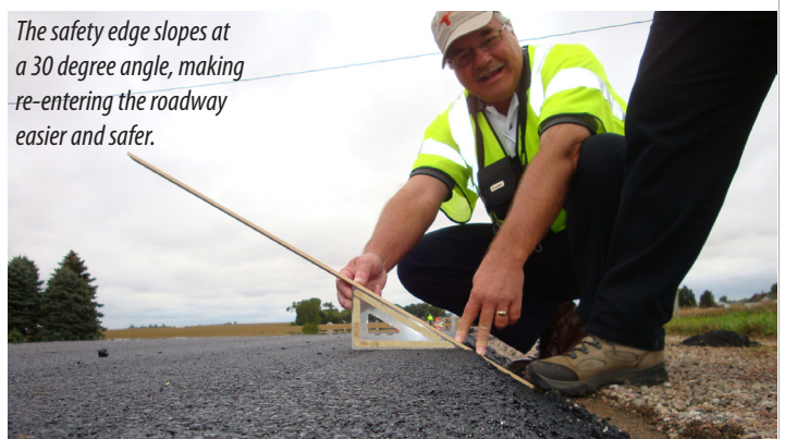
The safety edge slopes at a 30 degree angle, making re-entering the roadway easier and safer.

In terms of roadway edge durability, the gentle slope reduces the edge breakage. The oldest project in the country is now seven years old. "And even if the sloped edges eventually do break off, which we haven't seen yet, we would be no worse off than what we see today with traditional construction," said Roche.