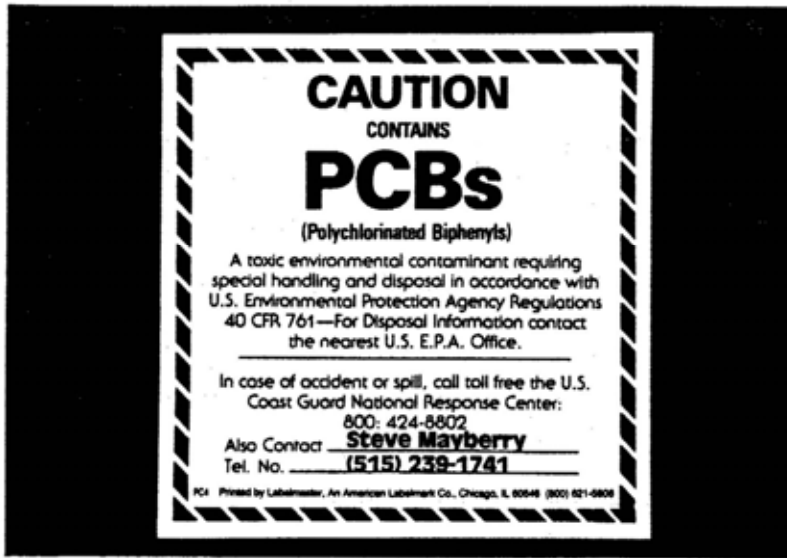
Photograph #11 Storage container label for ballasts. (Second of 2 labels required for ballasts.)