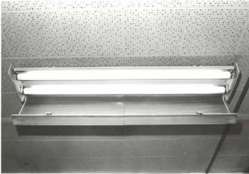
Photograph #6 Fluorescent fixture typically used for commercial and utility type household lighting. Bulbs range from 1.2 m to 2.4 m (4' to 8') in length.