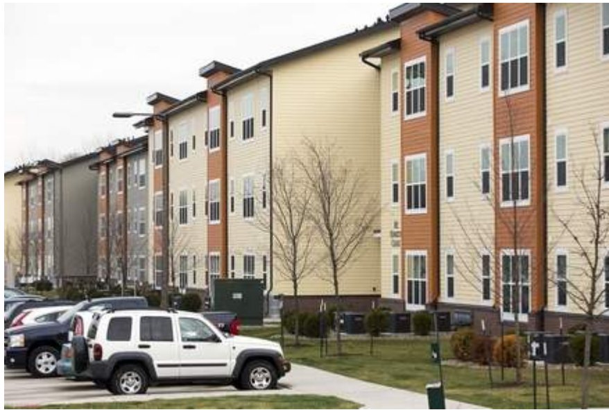
UI Housing concerns are about more than rent