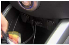
2012 Hyundai Veloster Dec 19, 2011