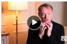
Jared Harris talks 'Sherlock Holmes' Dec 15, 2011