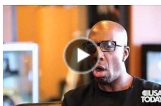
Talking Your Tech | JB Smoove Dec 19, 2011