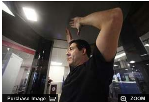
The PreCheck process allows certain frequent flyers and low-risk travelers to skip the most time-consuming security screening measures.

Marc Derrow walked straight through the security checkpoint Wednesday morning with his shoes and belt on. He estimated the PreCheck process saves him at least 5 minutes each time through.