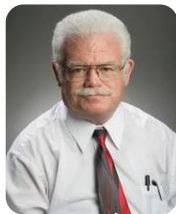
George C. Ford

Traffic moves along Edgewood Rd. SW near the intersection of 76th Avenue SW next to land that will be occupied by the soon-to-be developed Big Cedar Industrial Center located near The Eastern Iowa Airport in southwest Cedar Rapids, Iowa, on Friday, Nov. 25, 2016. The area marks the southeastern boundary of the industrial park. Iowa Land and Building, a subsidiary of Alliant Energy Corp., is developing the more than 1,300-acre industrial park. (Jim Slosiarek/The Gazette)