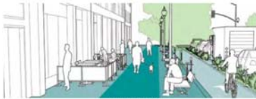
Pedestrian through zone, NACTO