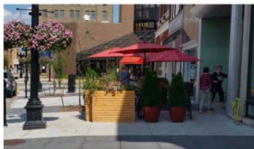
No pedestrian through zone