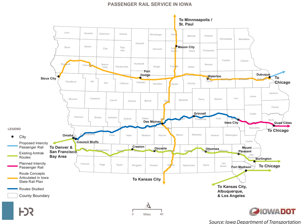
Figure 2.2: Existing and Potential Passenger Rail Routes Serving Iowa

In addition, two potential commuter rail services have been studied in the recent past or are currently under study. These pertain to the Iowa City-Cedar Rapids area and to the Des Moines area.